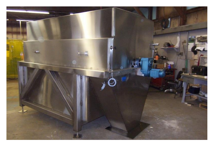
Shown on Manufacturing Floor

For the Removal of Suspended Solids from Process and Wastewater Streams Available in Wedge Wire or Perforated Stainless Steel