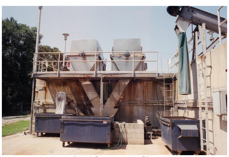
Dual Screens on Site

All metal components of Type-304 stainless steel construction unless otherwise specified